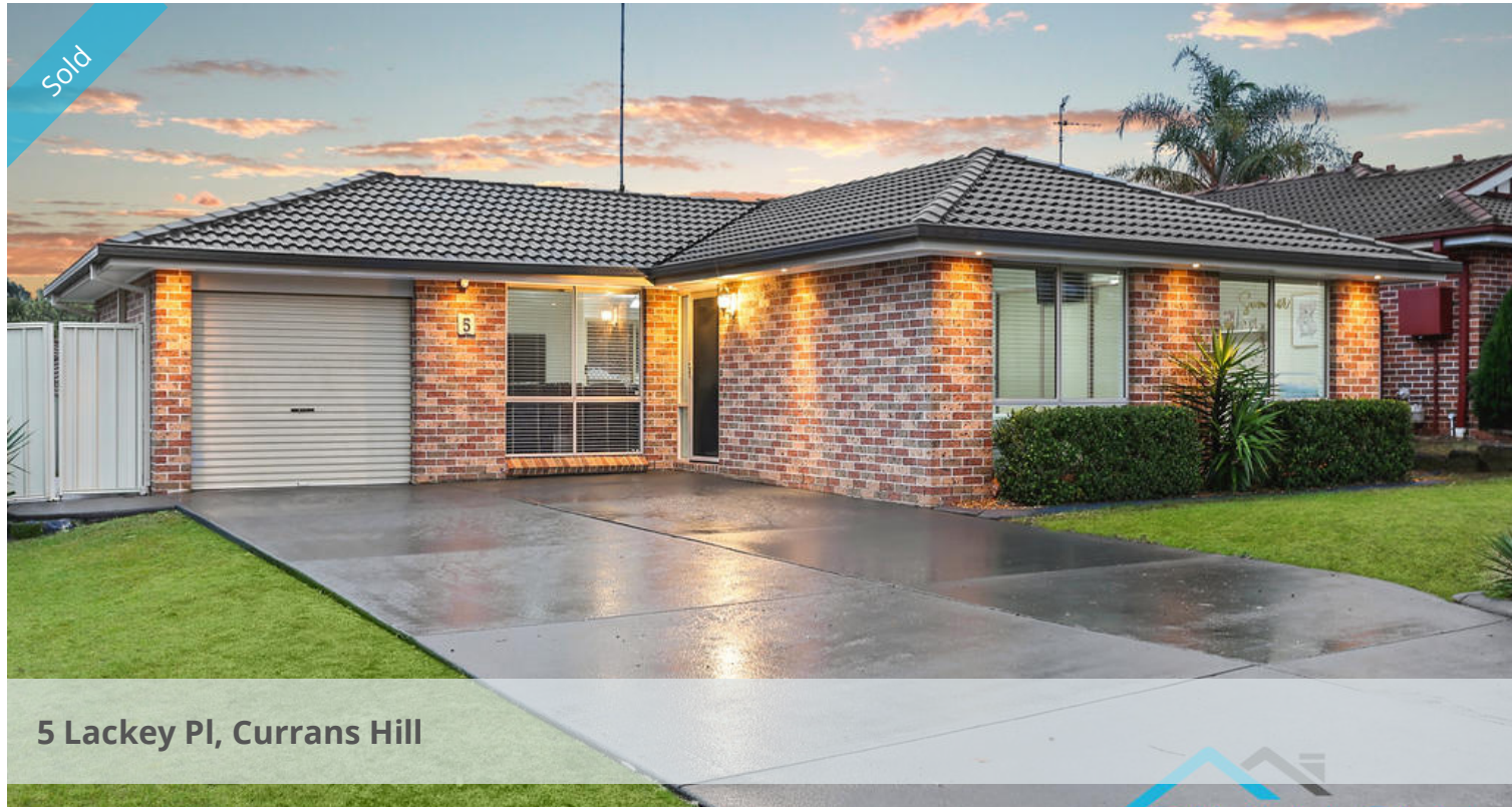
5 Lackey Pl, Currans Hill